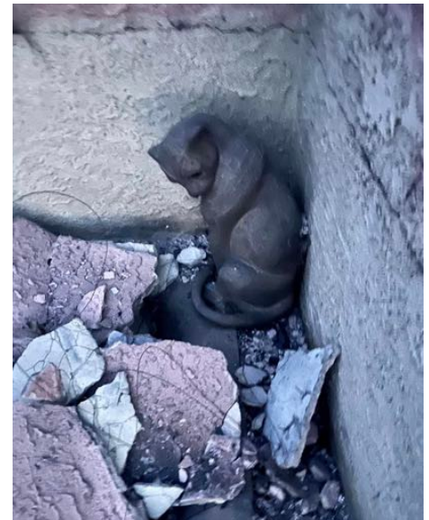
Jacque's Cat Sculpture - a survivor!